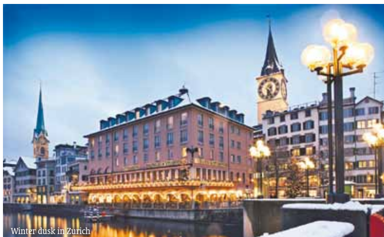
Winter dusk in Zurich

③ City Backpacker/Hotel Biber, Niederdorfstrasse 5 (044 251 90 15) »»www.city-backpacker.ch; Zurich Youth Hostel, Mutschellenstr. 114 (043 399 78 00) (tram no 7 until stop “Morgental”, follow the signs) »»www.youthhostel.ch/zuerich; Etap Hotel Zürich City-West, Technoparkstrasse 2 (044 276 20 00) »»www.etaphotel.com. For more accommodation in Zurich ask at the tourist office.