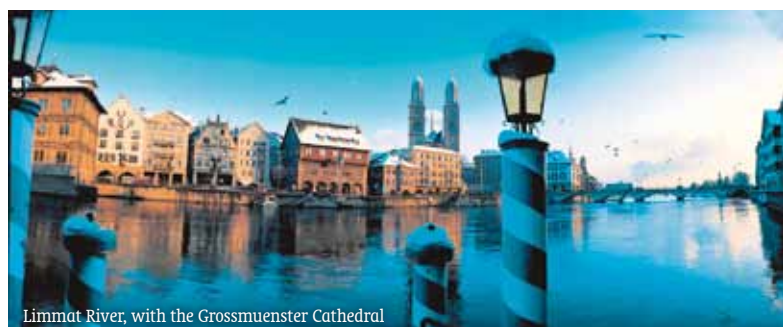
Limmat River, with the Grossmünster Cathedral