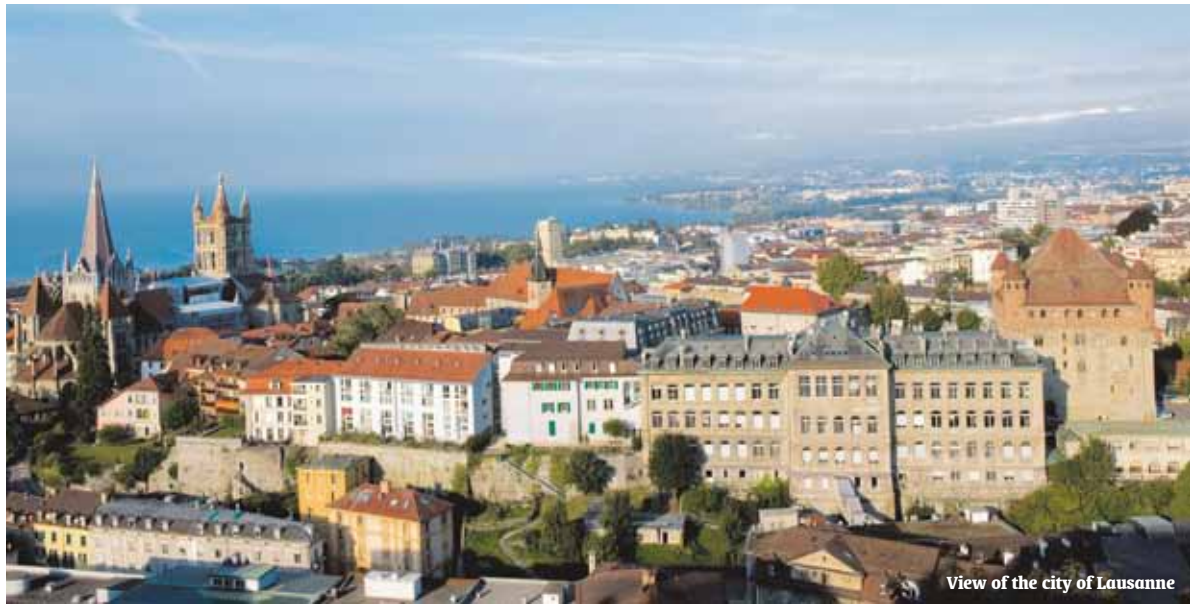
View of the city of Lausanne

10 Bikes to borrow free of charge! Pick up at Place de l'Europe, open daily 8 am – 6 pm from April 15th until October 31st. Deposit of CHF 20.– and you need to show your passport or ID card. Great summer deal even though Lausanne is a city of some steep hills.