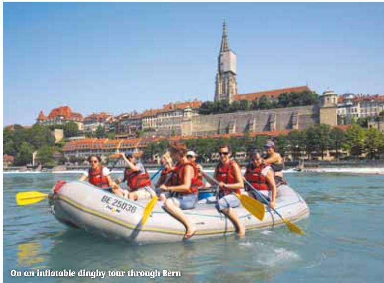
On an inflatable dinghy tour through Bern

⑥ Bikes to borrow free of charge (they also have flyer electrobikes, scooters and skateboards). Pick up at Milchgässli (next to Bahnhofplatz), at Hirschengraben and at Zeughausgasse, open daily from May (Hirschengraben from June) until the end of October, 7.30 am – 9.30 pm (before May pick up at Milchgässli only!). Bikes are free of charge for 4 hours, every additional hour costs CHF 1.– Deposit of CHF 20.– and passport or ID required. Bern's best summer deal!