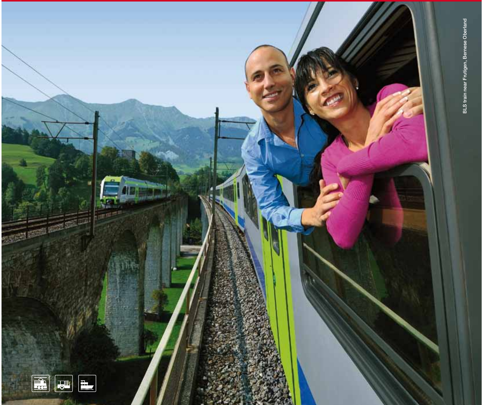
BLS train near Frutigen, Bernese Oberland

The formula to discover Switzerland in all its variety: the Swiss Travel System. A system ticking like a Swiss clockwork. Trains, whenever you are on the go. Buses to take you farther. Boats to make you enjoy the beauty of the lakes. And spectacular mountain railways to bring you to the very top. Have it all with one ticket, the Swiss Pass. Save some extra money when you are under 26, when you travel in pairs or with your family. The Swiss Pass is available at most railway stations in Switzerland.