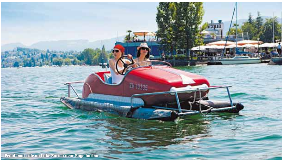
Pedal boat ride on Lake Zurich near Enge harbor