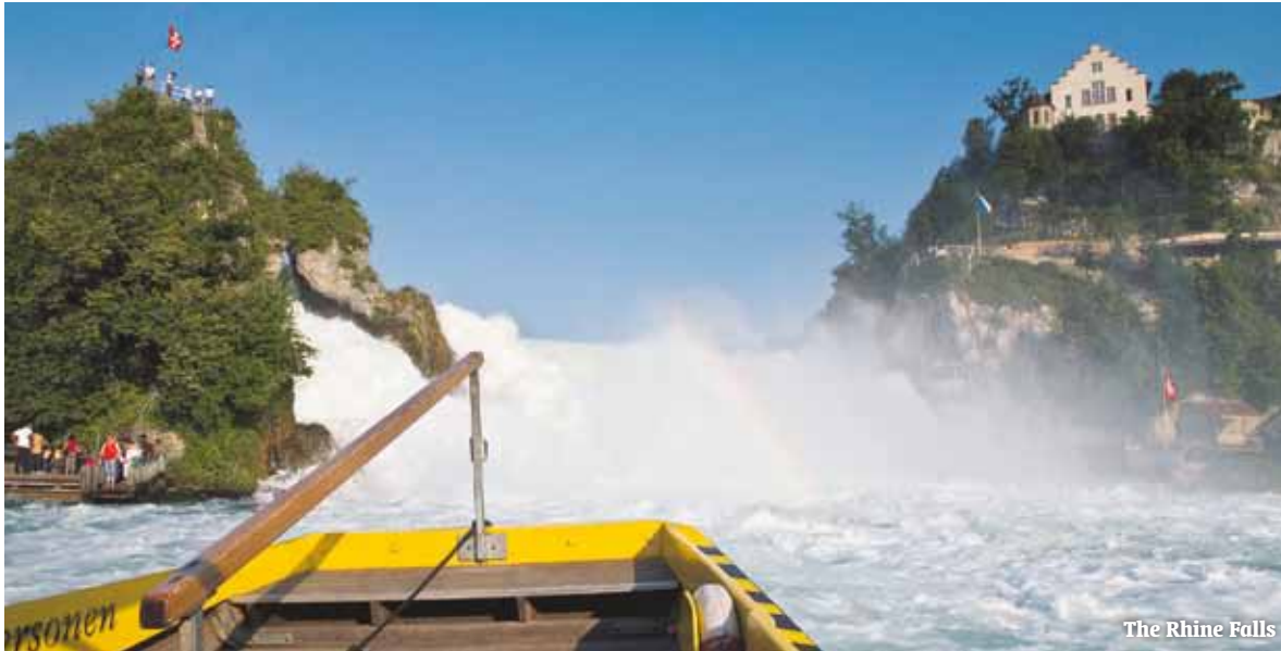
The Rhine Falls