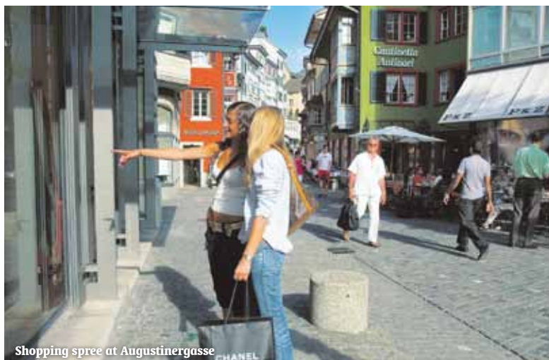
Shopping spree at Augustinergasse

③ City Backpacker/Hotel Biber, Niederdorfstrasse 5 (044 251 90 15) »www.city-backpacker.ch; Zurich Youth Hostel, Mutschellenstr. 114 (043 399 78 00) (tram no 7 until stop “Morgental”, follow the signs) »www.youthhostel.ch/zuerich; ④ Hotel Hottingen, Hottingerstrasse 31/Cäcilienstrasse 10 (044 256 19 19) (tram no 3 until stop “Hottingerplatz”) »www.hotelhottingen.ch; Etap Hotel Zürich City-West, Technoparkstrasse 2 (044 276 20 00) »www.etaphotel.com; Richterswil Youth Hostel, Hornstrasse 5, Richterswil (Richterswil is 27 minutes by train from Zurich, see page 10) (044 786 21 88) »www.youthhostel.ch/richterswil; Etap Hotel Winterthur (Winterthur is 20 minutes by train from Zurich, see page 10), Brühlbergstrasse 7a (052 264 84 00) »www.etaphotel.com For more accommodation in and around Zurich ask at the tourist office.