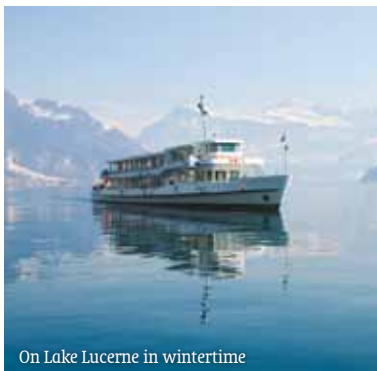
On Lake Lucerne in wintertime

3 Backpackers Lucerne, Alpenquai 42, (041 360 04 20) »www.backpackersluzerne.ch; 4 Lion Lodge Luzern, Zürichstrasse 57 (041 410 01 44) »www.lionlodge.ch; Lucerne Youth Hostel, Sedelstr. 12 (041 420 88 00) (take bus no 18 from the train station and get off at the stop "Jugendherberge", takes 18 minutes) »www.youthhostel.ch/luzern; Etap Hotel Luzern, Kellerstrasse 4–8 (041 367 80 00) »www.etaphotel.com