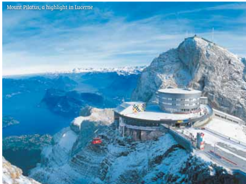
Mount Pilatus, a highlight in Lucerne

Budget accommodation in Schwyz: Hirschen Backpackers Schwyz, same place as Hirschen Pub, Hinterdorfstr. 14 (041 811 12 76). »www.hirschen-schwyz.ch