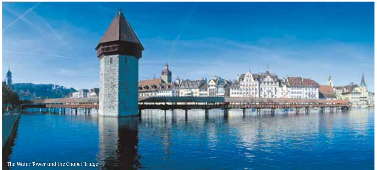
The Water Tower and the Chapel Bridge

Lucerne is unique, you'll love it! Centrally located, just an hour south of Zurich and Basel, it offers an incredible panorama. Lucerne lies at the western end of Lake Lucerne (Vierwaldstättersee) which is the geographical and spiritual heart of Switzerland. The city, as well, features the world-famous medieval Chapel Bridge (Kapellbrücke), connecting the old part of town to the new. The over 660-year-old wooden-covered bridge partially burnt down in 1993 but has been restored to its original condition. You'll be charmed by Lucerne's misty lake, by the snow-capped mountains rising above, and the many possibilities for excursions you have from here.