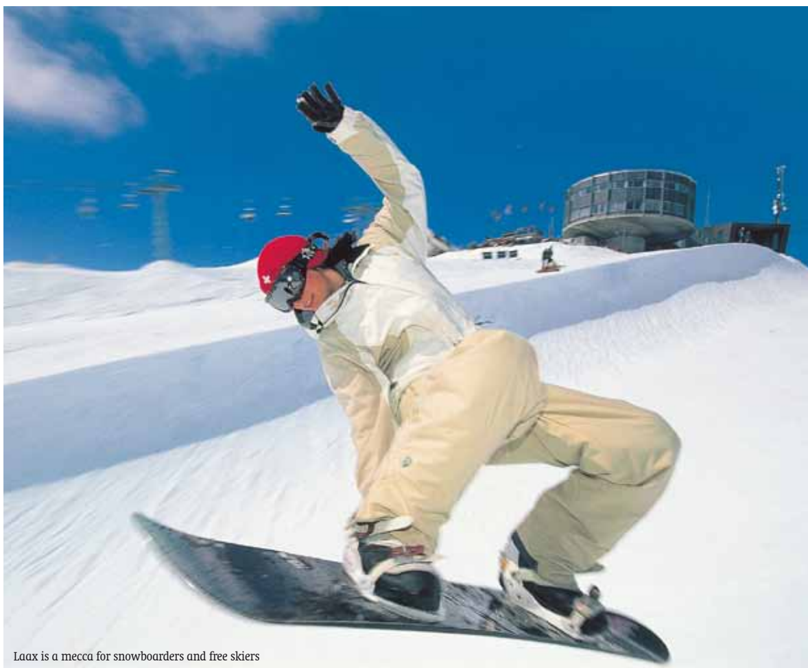
Laax is a mecca for snowboarders and free skiers