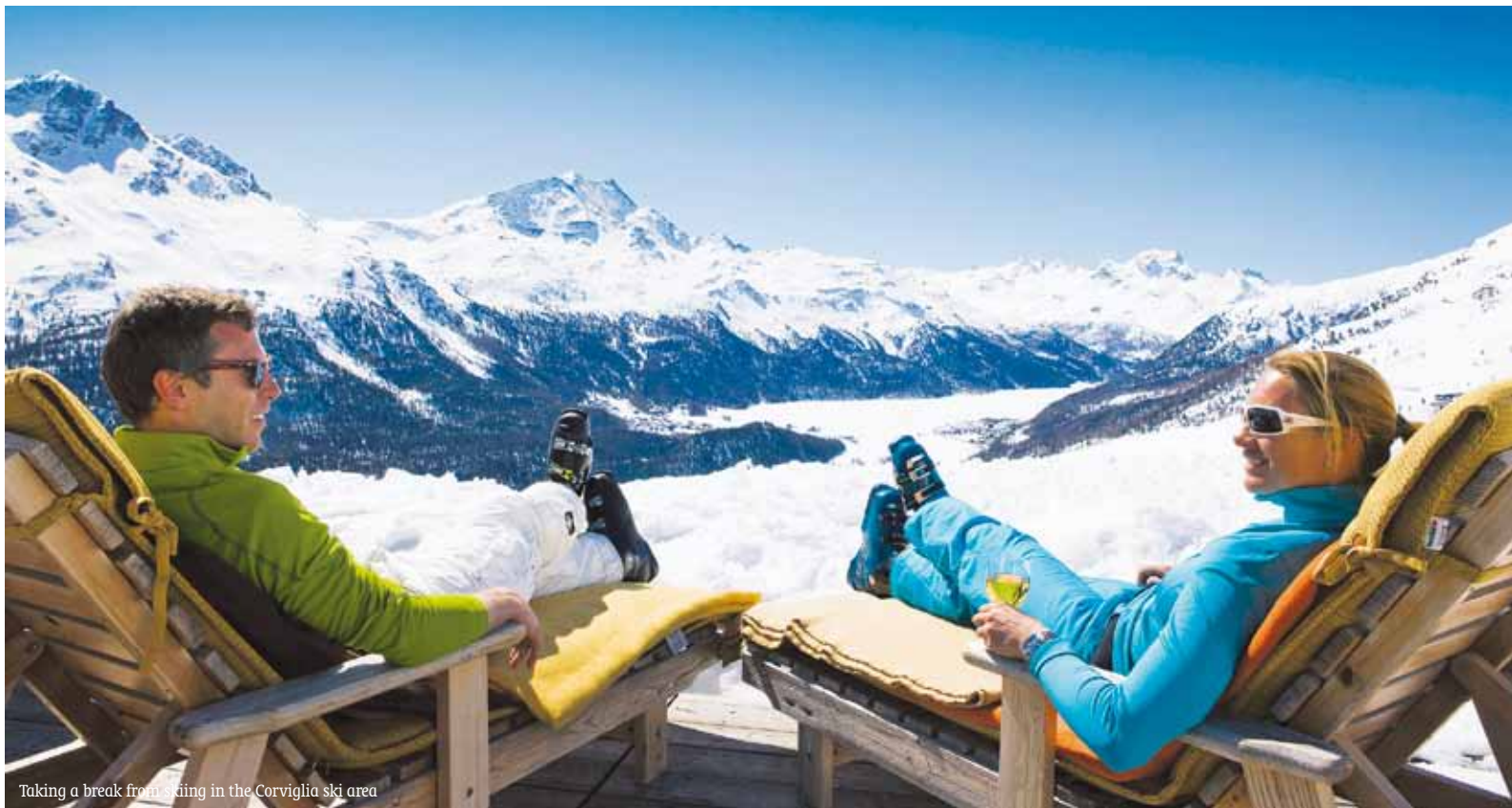
Taking a break from skiing in the Corviglia ski area

G rison (Graubünden in German) is one of Switzerland's biggest cantons and hosts many famous resorts, including the Flims-Laax-Falera, St. Moritz, Davos, Klosters, Scuol and many more. Grison attracts skiers and snowboarders to some of the most comprehensive ski resorts of the Alps. All villages and holiday destinations described below are reached by train or postbus from Chur (capital of Grison and only 1 hour by train from Zurich).